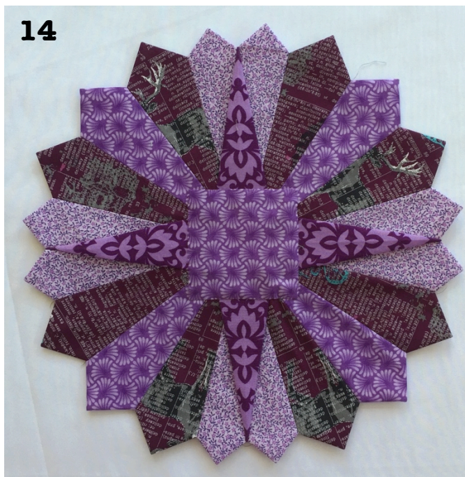
Sun Day Parasols