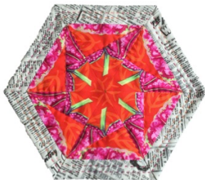
Week 52 Block 52: Katja

Modern Backgrounds Essentials by Brigitte Heitland for Zen Chic for Moda - Paper