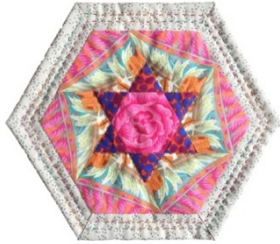
Week 48 Block 48: Jeannie

The details: The week, the block number, the name, and the fabric.