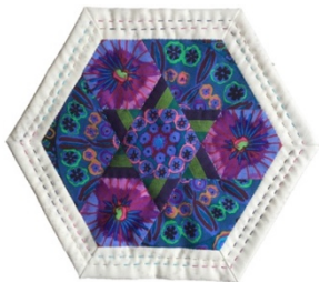
Week 50 Block 50: Joanne

Modern Backgrounds Essentials by Brigitte Heitland for Zen Chic for Moda - Paper