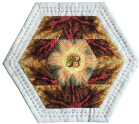
Week 49 Block 49: Irene

Modern Backgrounds Essentials by Brigitte Heitland for Zen Chic for Moda - Paper