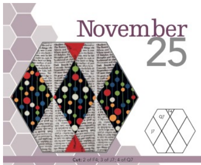
Calendar image used courtesy of Martingale from The New Hexagon Perpetual Calendar , Copyright 2016