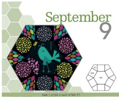
Calendar image used courtesy of Martingale from The New Hexagon Perpetual Calendar , Copyright 2016